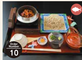
Order Number 10 Hitsumabushi Kamameshi Set (Finely chopped eel with rice cooked and served in a small iron pot) ひつまぶし釜飯御膳 ¥3,200

A separate venue of the famous restaurant Waremokou on Soba Street. We serve original soba cuisine and food using the famous brand of Aso beef called Aka-ushi. Fully private rooms are available. Enjoy a relaxing meal.