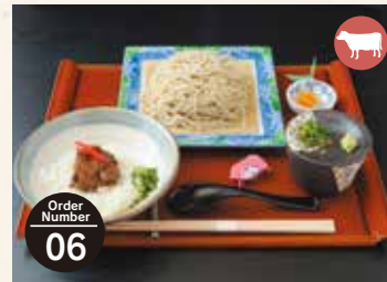
Order Number 06 Beef Bowl Set 牛めし御膳 ¥2,200