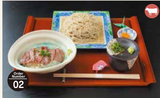
Order Number 02 Aka-ushi Beef Bowl Set (Aka-ushi means Japanese Brown cattle) あか牛丼御膳 ¥2,500