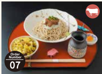
Order Number 07 Aka-ushi Shigure Set with Mustard Greens (Beef from Japanese Brown cattle simmered with ginger and soy sauce) あか牛しぐれ御膳 (高菜めし付) ¥1,800