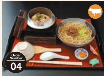
Order Number 04 小锅什锦红牛筋饭御膳 赤牛筋釜飯御膳 아카규 소심줄의 가마솥밥 세트