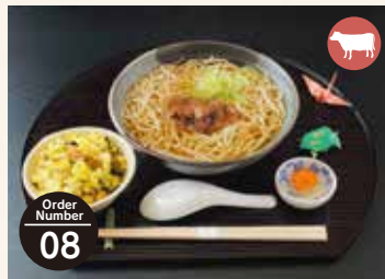
Order Number 08 Aka-ushi Soba Set with Mustard Greens (Buckwheat noodles with beef from Japanese Brown cattle) あか牛そば御膳 (高菜めし付) ¥1,700