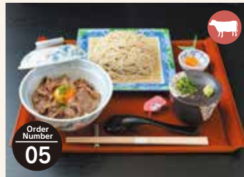
Order Number 05 Aka-ushi Sukiyaki Don Set (Simmered beef from Japanese Brown cattle in a sweet sauce served on a bowl of rice) あか牛すき丼御膳 ¥2,400