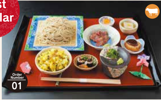
Order Number 01 HANARE 御膳 (送雪菜拌饭) Hanare 御膳 (附芥菜飯) 하나레 세트 (갓나물 밥 곁들림)