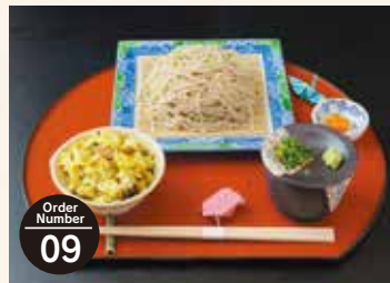
Order Number 09 Soba Set with Mustard Greens (Buckwheat noodles) そば御膳 (高菜めし付) ¥1,200